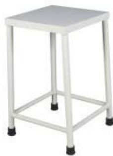
ATMS-26A MS Top