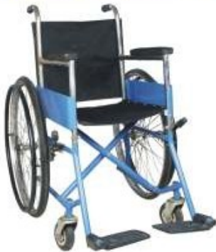
ATMS-36A Wheel Chair (Folding)