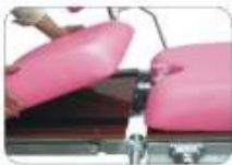
Easy Fixing Mattress