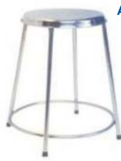
ATMS-26B SS Top