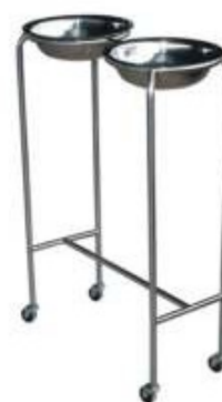
ATMS-27B Double Bowl