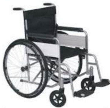
ATMS-36B Wheel Chair (Fixed)