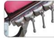
Improved Universal Clamp