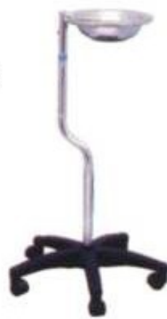
ATMS-27A Single Bowl