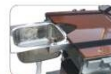
Easy insertion of Drainage Basin