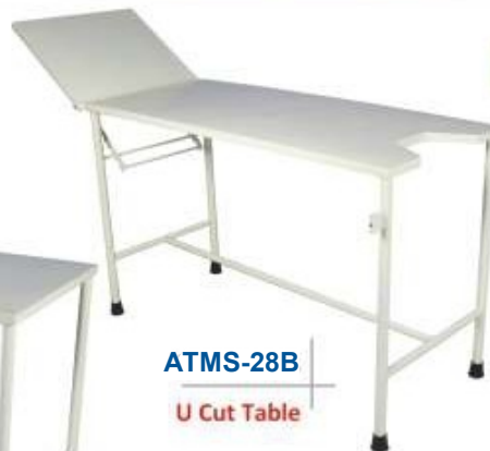
U Cut Table