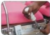
Hand Grip can be adjusted